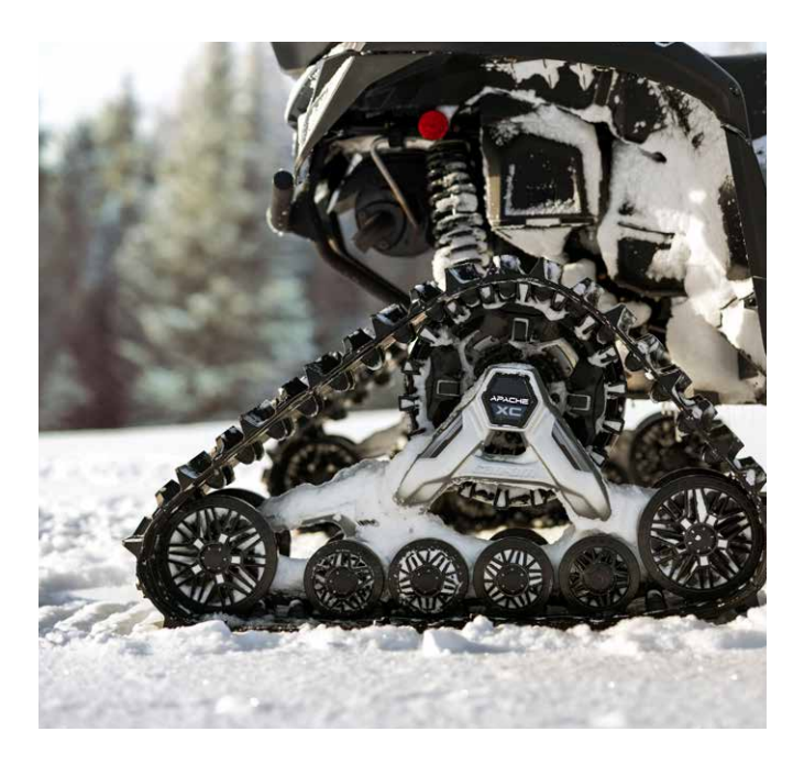
VERSATILE TRACK SYSTEMS